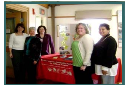
GLCPC Staff Members at a Community Outreach Event at Lawrence Heritage State Park

GLCPC partnering agencies provide play groups, mental health consultation to programs and families, training for staff, workshops for families, as well as after school care and interactive family literacy. For more information , visit the GLCPC website and look at the calendar for playgroup information, training dates, Council meetings and links to sites for children.